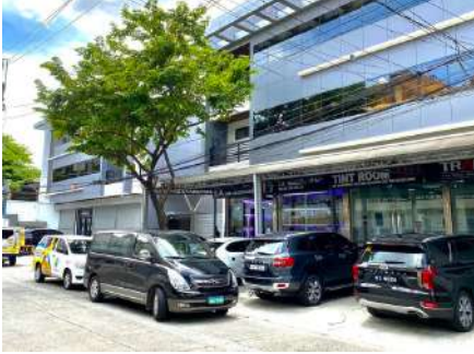
L.A. Group Headquarters in Guijo St. Makati

The company supplied air and surface purifiers to homes, restaurants, and real estate companies, something he revived in the Philippines in 2020 as part of the group's growth.